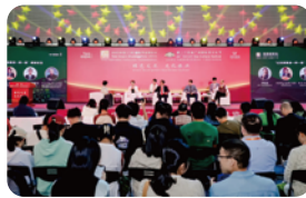
The Tenth Media's Perspective on National Tea Forum