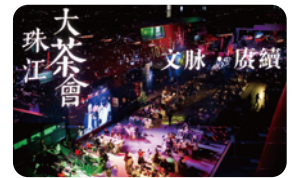
Pearl River Grand Tea Event