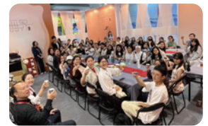
Cross-boundary Tea Gathering and more than 50 other activities