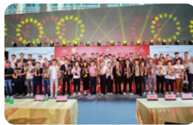
Award Ceremony of 2003 National Great Tea Promotion