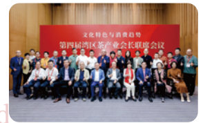
The Fourth Joint Forum of Tea Industry Presidents in GBA