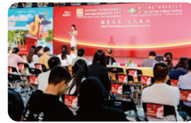
The First China Tea Industry Douyin E-commerce Carnival