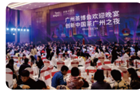
Welcome Dinner & Top 100 Innovators Award Ceremony