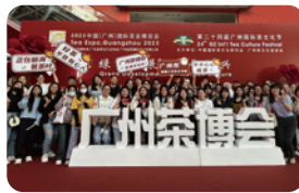
80,000 sqm exhibition areas and more than 600 exhibitors

Revitalizing Cultures Sharing the Goodness